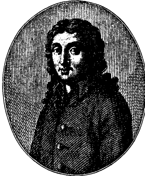
ALESSANDRO SCARLATTI. (1659—1725).

A LESSANDRO SCARLATTI was born in Sicily in 1659 or possibly 1658. His first opera "L'Errore Innocente," was produced at Rome in 1679. In 1684 he was appointed Maestro di Cappella to the Viceroy at Naples. In 1702 he was at Rome and became assistant Maestro di Cappella, and in 1707 principal Maestro at the church of S. Maria Maggiore. In 1706 he became a member of the Arcadian Academy, Corelli and Pasquini being elected at the same time. From 1708 Scarlatti was principally connected with Naples where he produced operas and oratorios. In 1721 his 114th and last opera "Griselda" was produced at Rome. The composer died at Naples, October 24th, 1725, and was buried in the church of Montesanto.