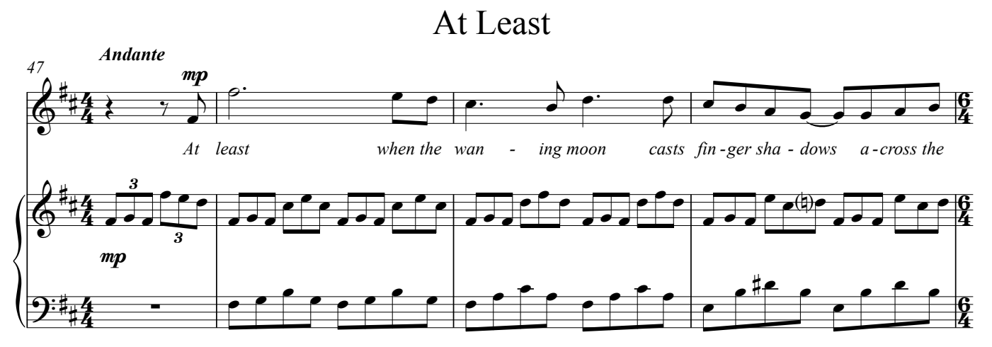
with lots of delicate but not at all clean pedal