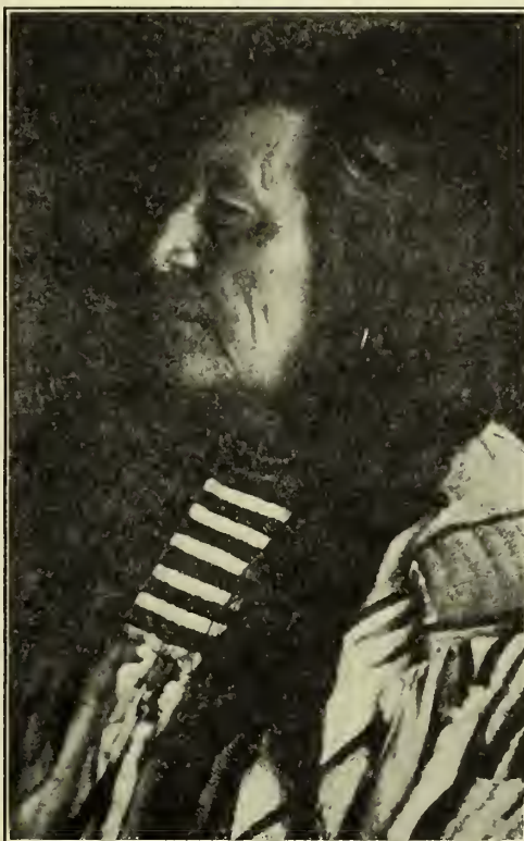
A CROW CHIEF.

On the day appointed, at sunrise, cedar boughs were cut and hauled in from the mountains to construct a corral about 200 feet in diameter. In the center the fire tenders piled high the wood, and the fires were started. Preliminary worship and ceremonies had been in progress for several days prior to the dance. A sacred painting had been prepared, in which the sun, moon, stars, and various animals were drawn. Prayer sticks were placed at the ends, and a patient was laid on the painting while the medicine man went through his manipulations of the art of healing. A medicine had been prepared, and when it proved to be good all Navajos present dipped their hands in it and applied it to their bodies. This ceremony is sacred to the Indians, and they believe in the power of the medicine man. Whether the medicine man believes in it we cannot say. "Medicine" does not mean drugs or lotions to an Indian. It means ceremonies, prayer, applications or anything to invoke the Great Spirits. Whatever works the opposite is "bad medicine." The dancers entered and encircled the