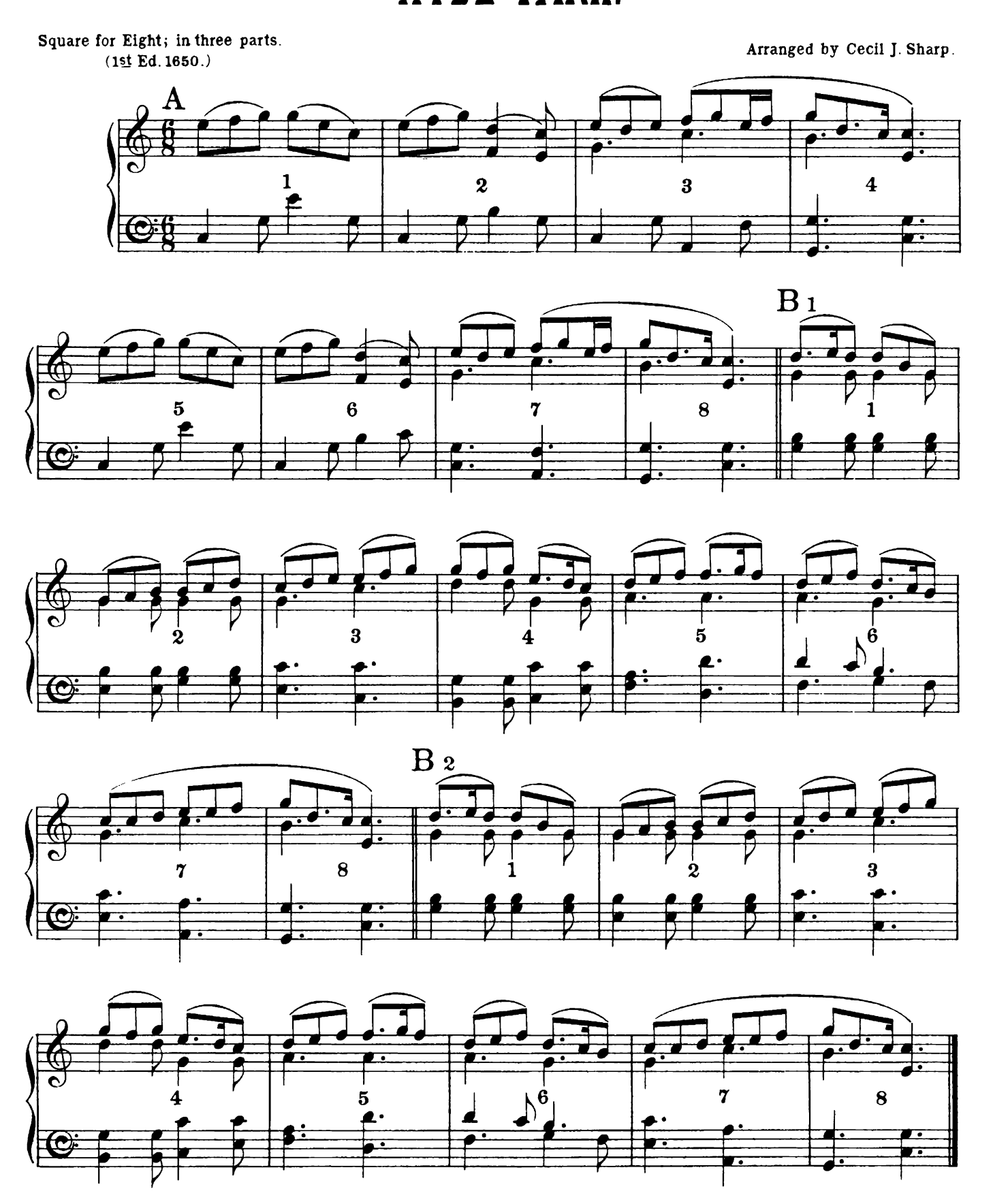
13790 Copyright, 1912, by Novello & Company, Limited.