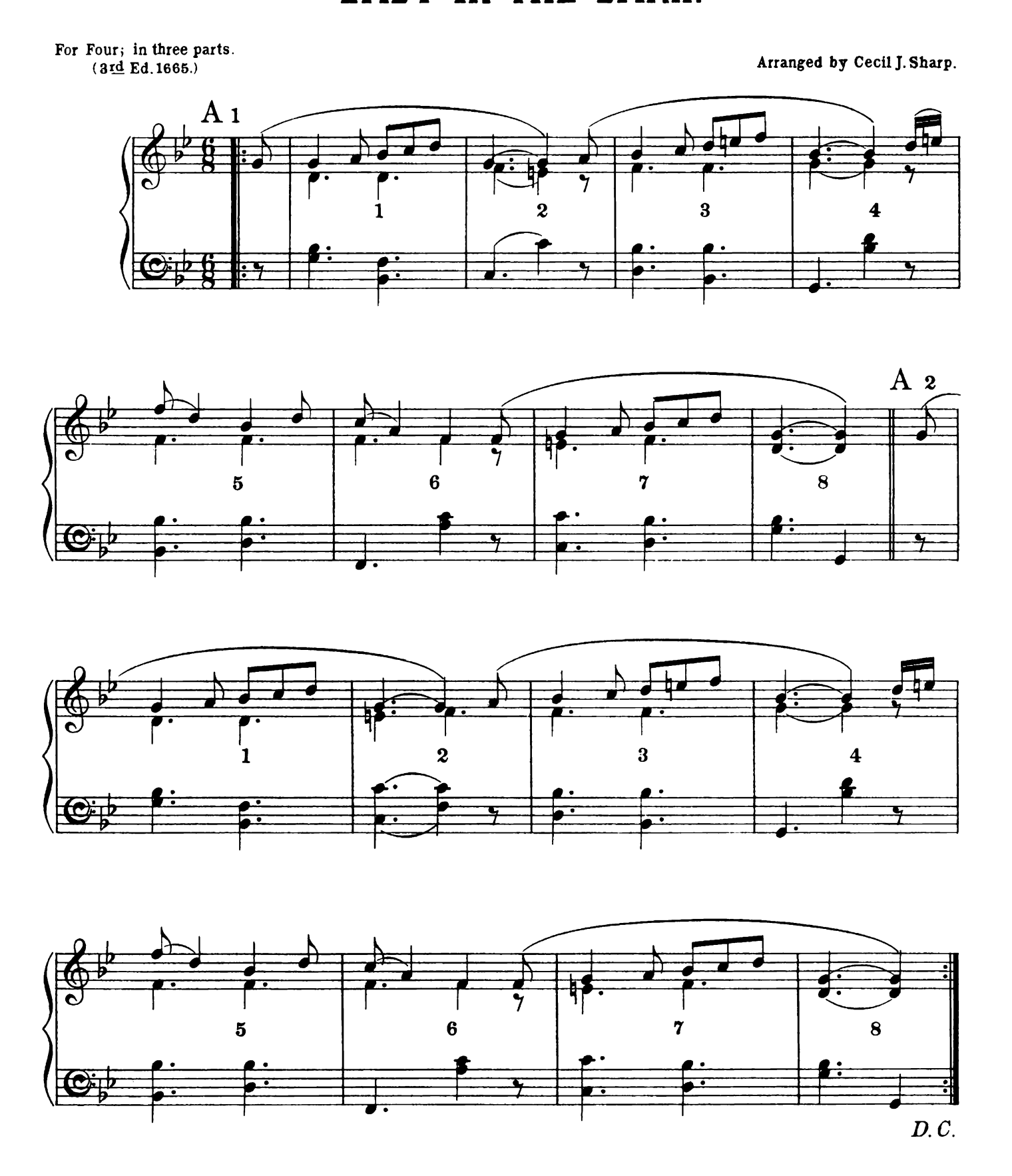
18790 Copyright, 1912, by Novello & Company, Limited.