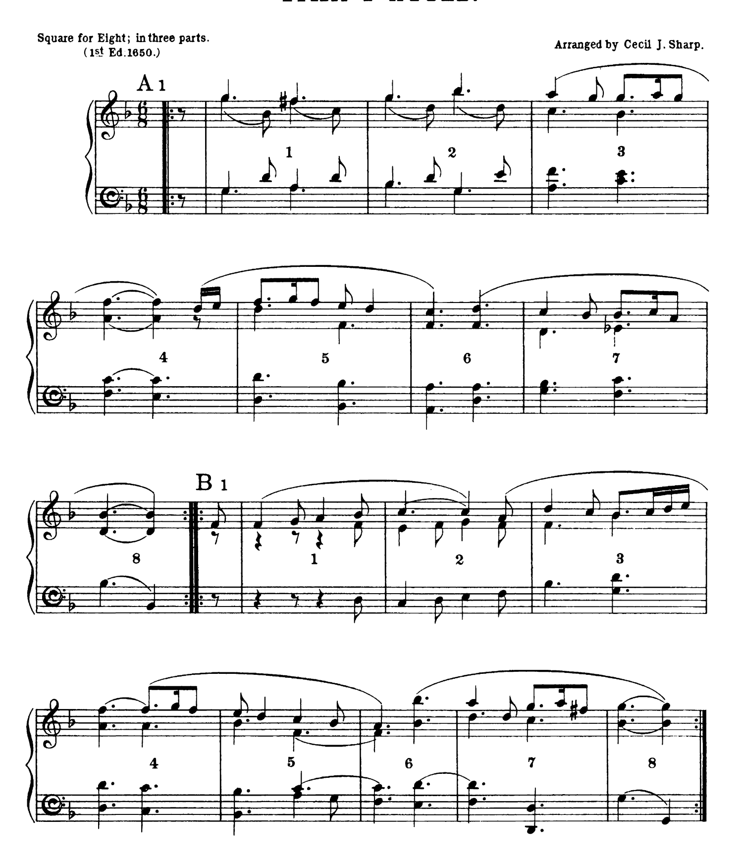
13790 Copyright, 1912, by Novello & Company, Limited.