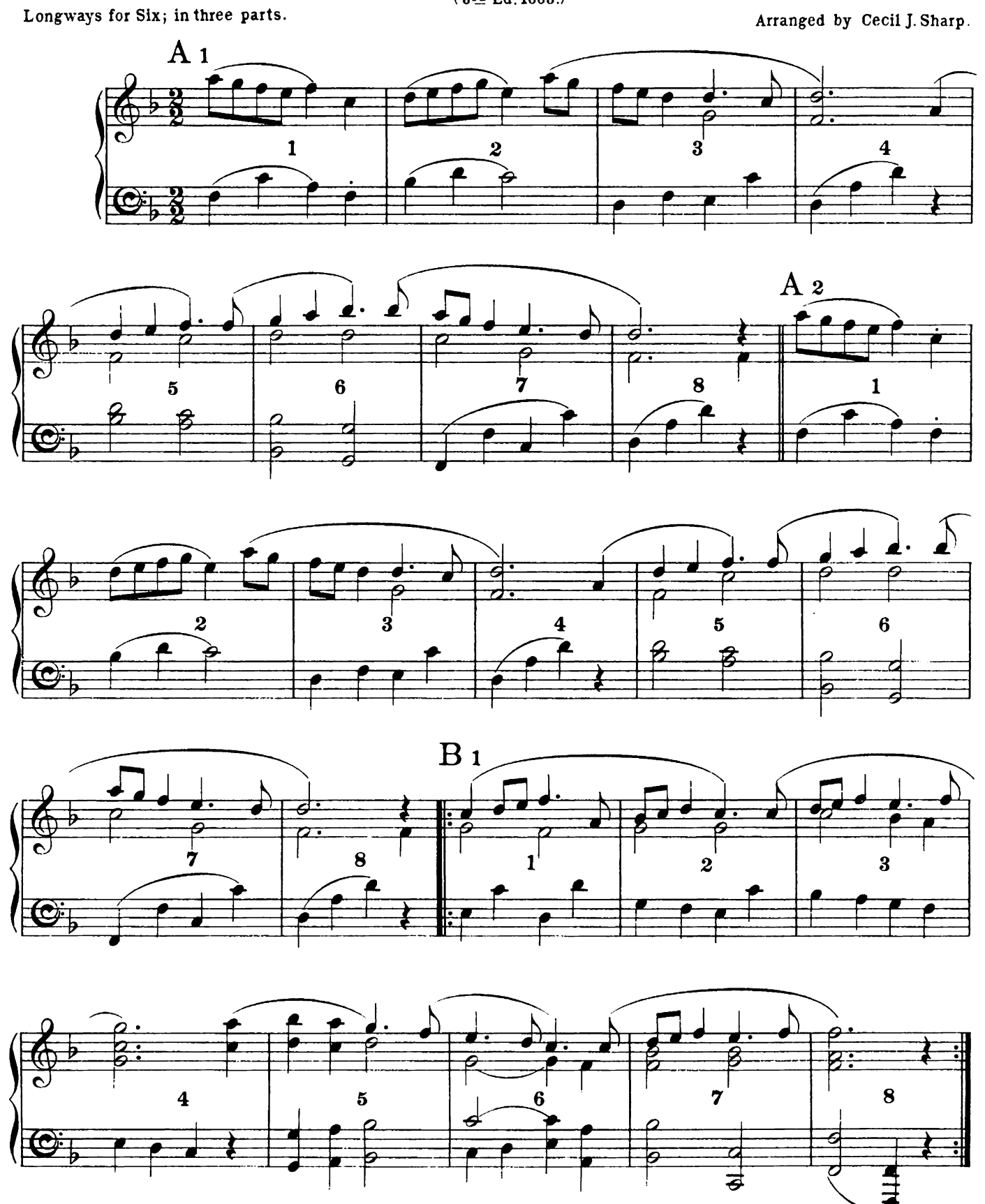
13790 Copyright, 1912, by Novello & Company, Limited.

(To the tune of The New Exchange.) (3rd Ed. 1665.)