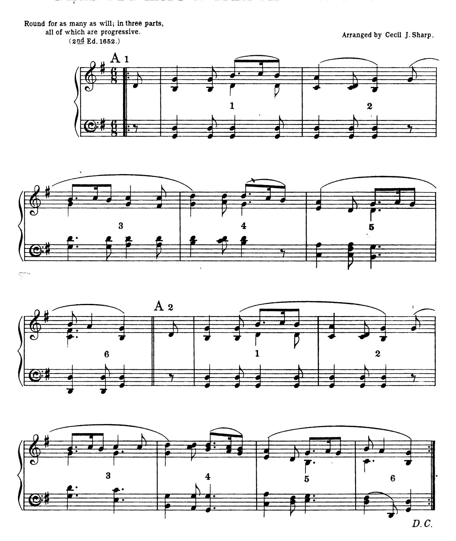
18790 Copyright, 1912, by Novello & Company, Limited.