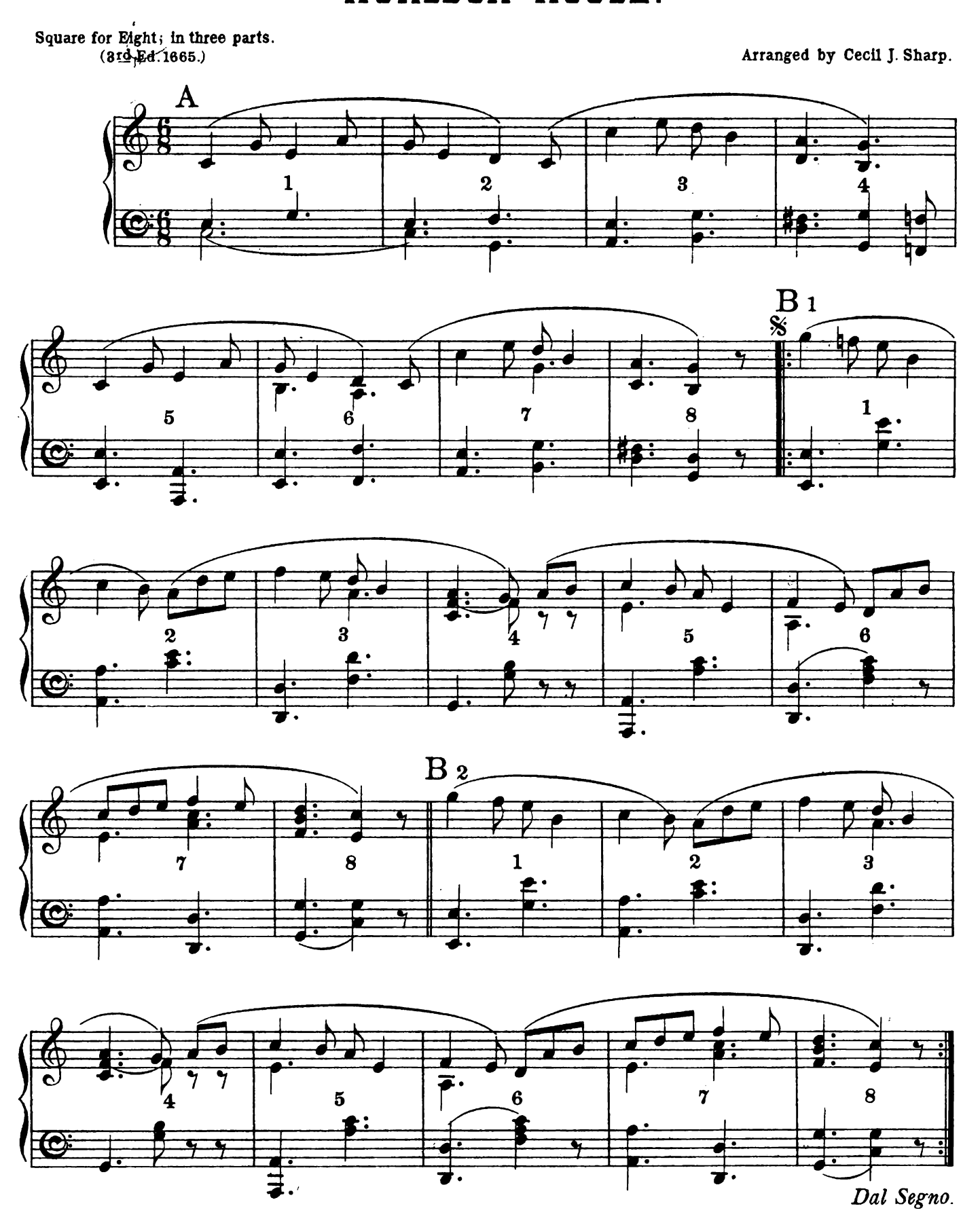
18790 Copyright, 1912, by Novello & Company, Limited.