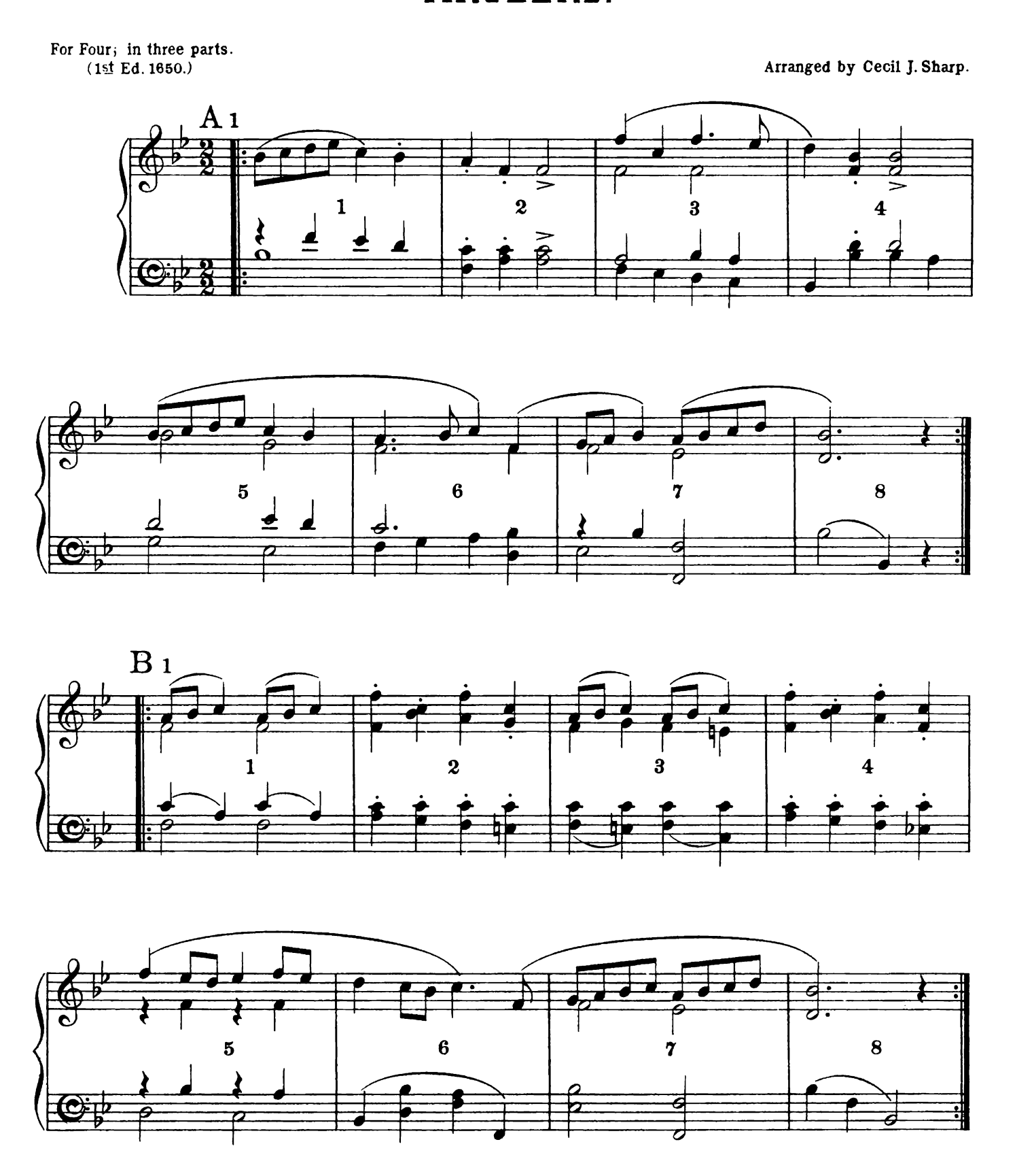
18790 Copyright, 1912, by Novello & Company, Limited.