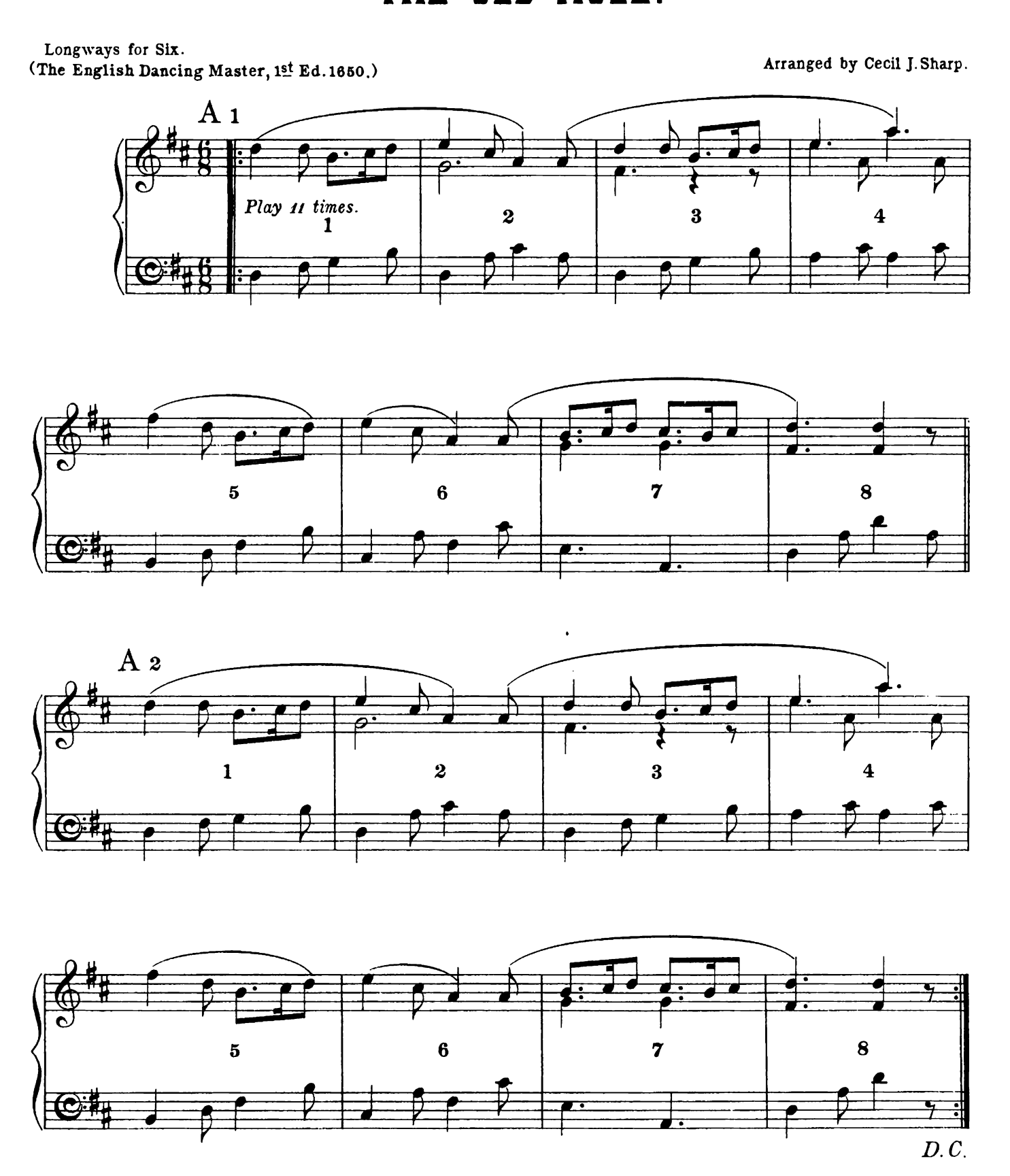
13790 Copyright, 1912, by Novello & Company, Limited.