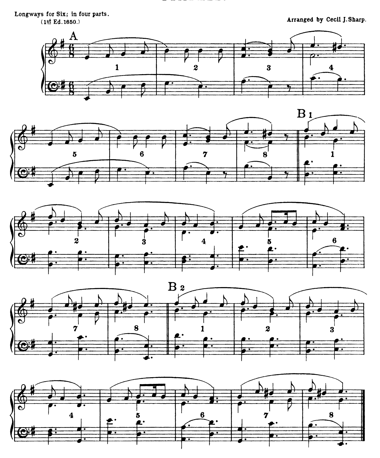
13790 Copyright, 1912, by Novello & Company, Limited.