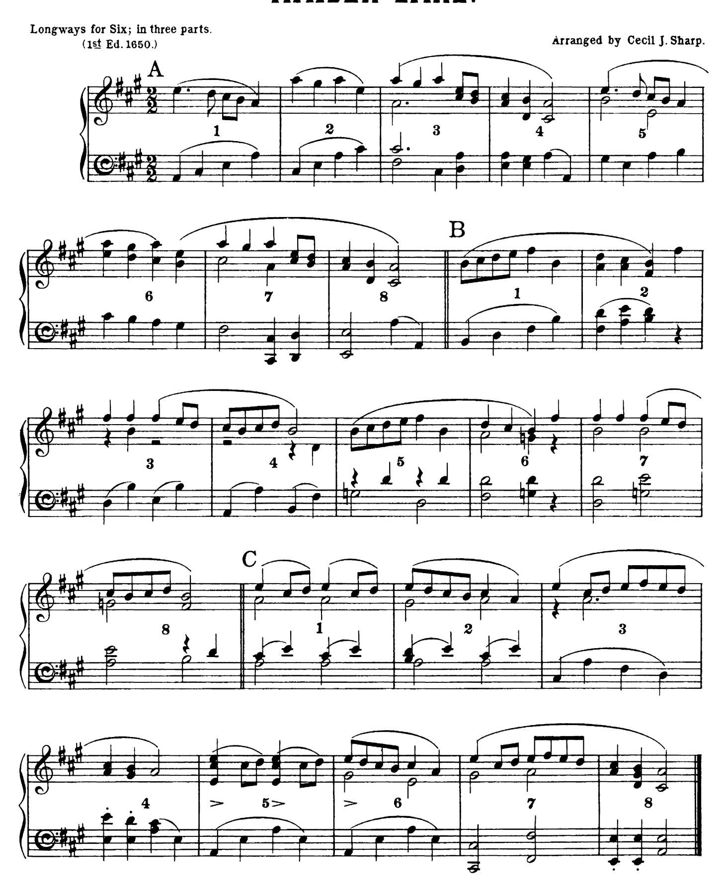
18790 Copyright, 1912, by Novello & Company, Limited.