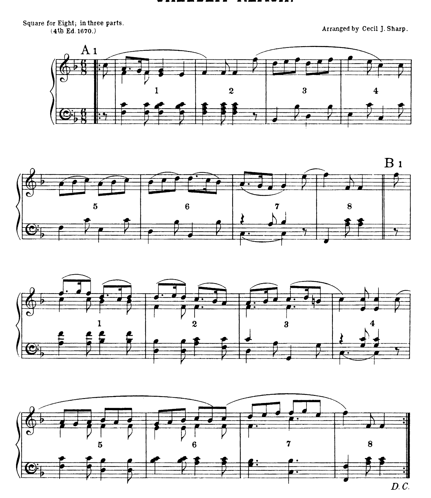
13790 Copyright, 1912, by Novello & Company, Limited.