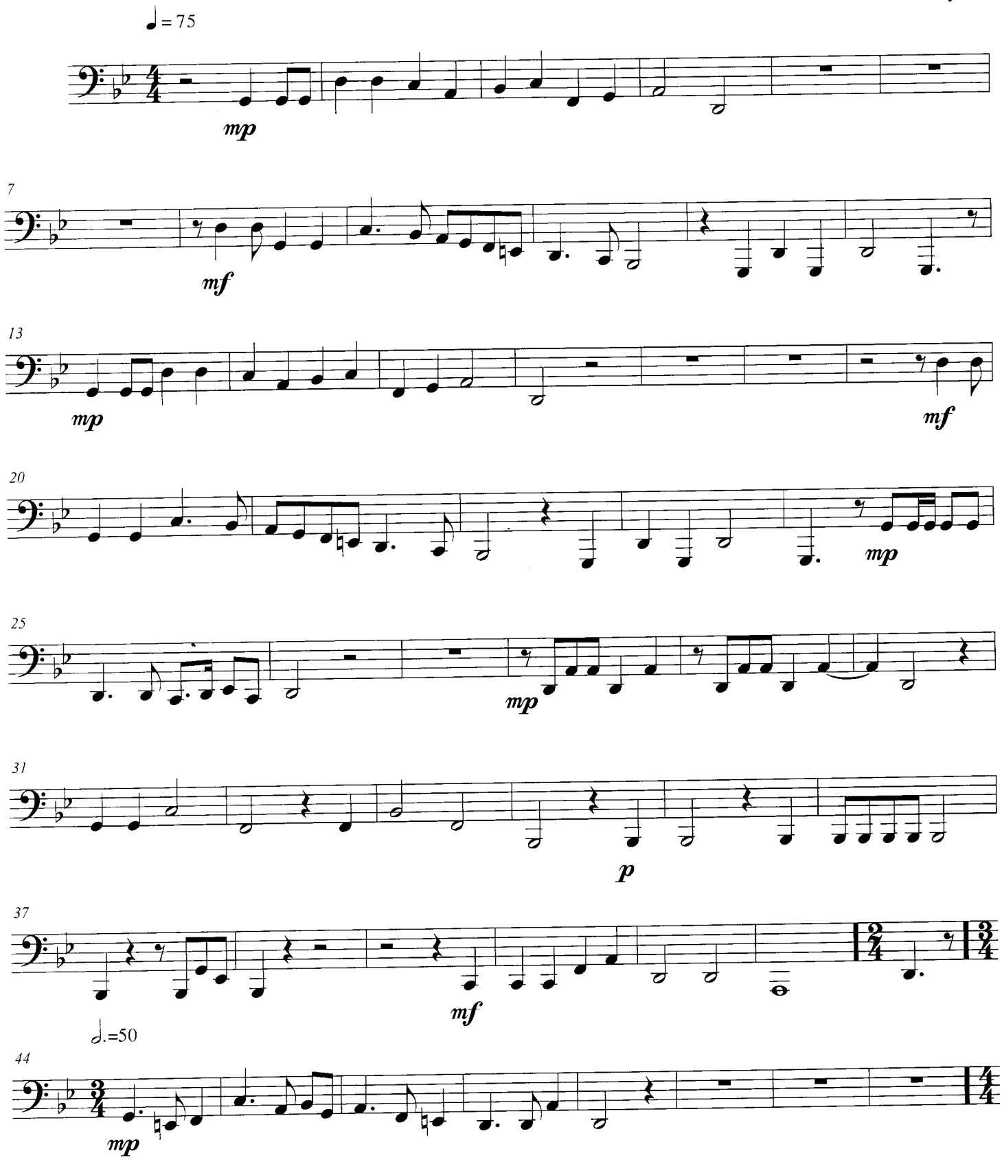
from Sacrae Symphoniae (1597)