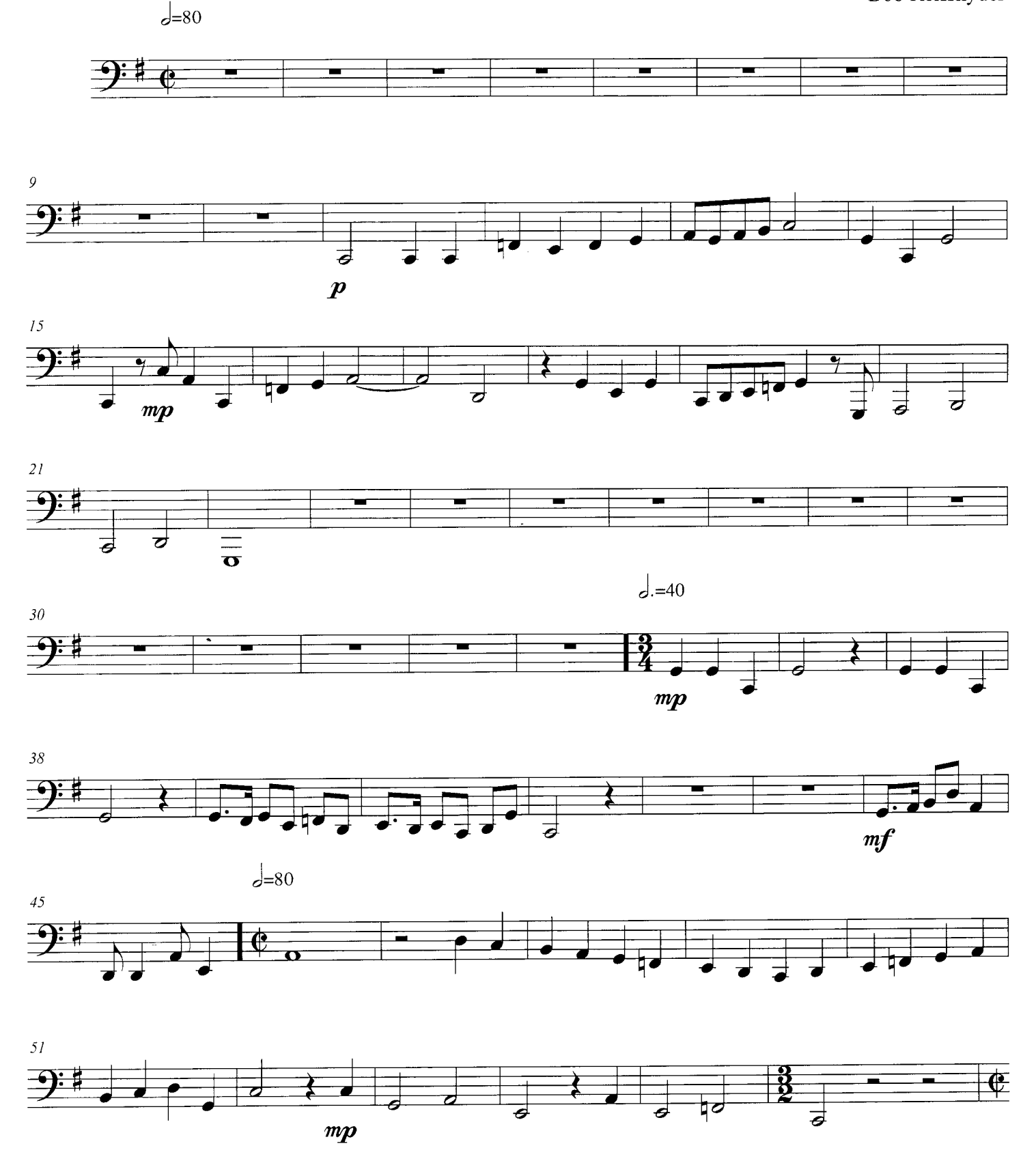
from Sacrae Symphoniae (1597)