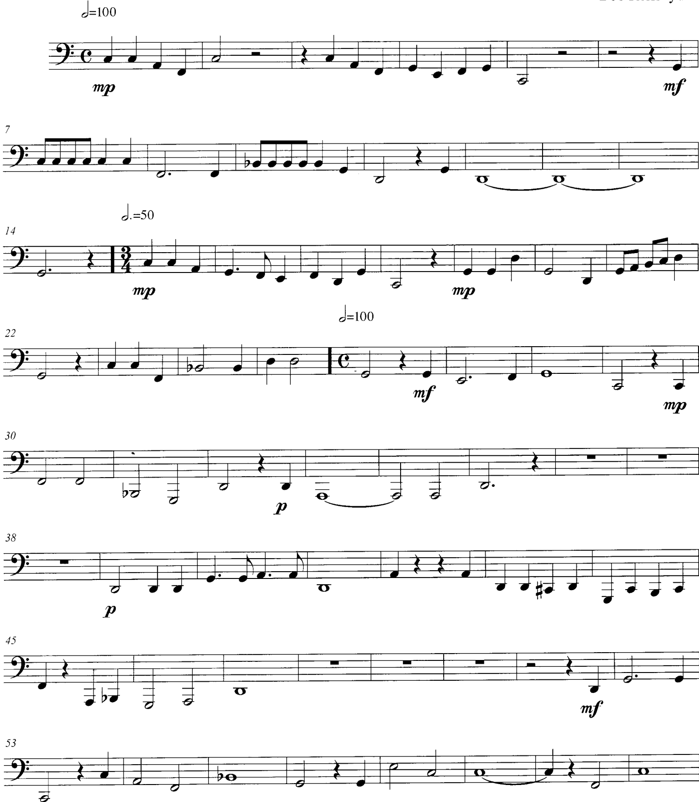
from Sacrae Symphoniae (1597)