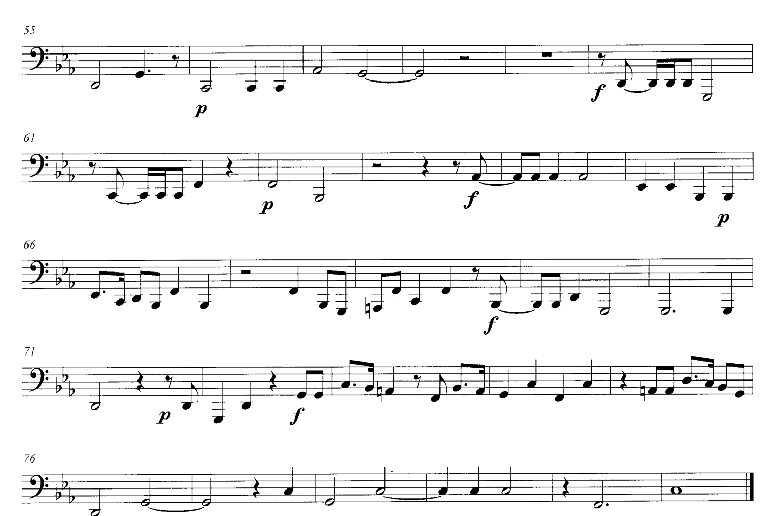
Sonata pian e forte