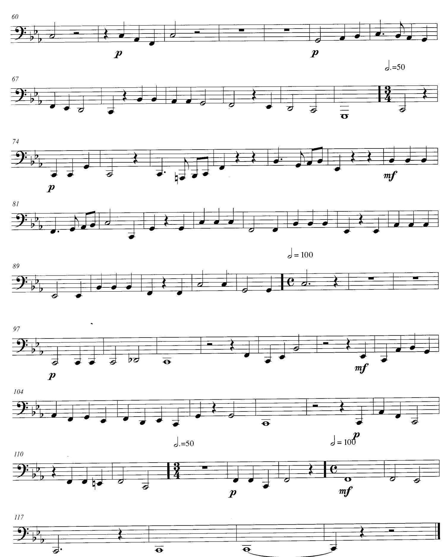
Canzon Noni Toni