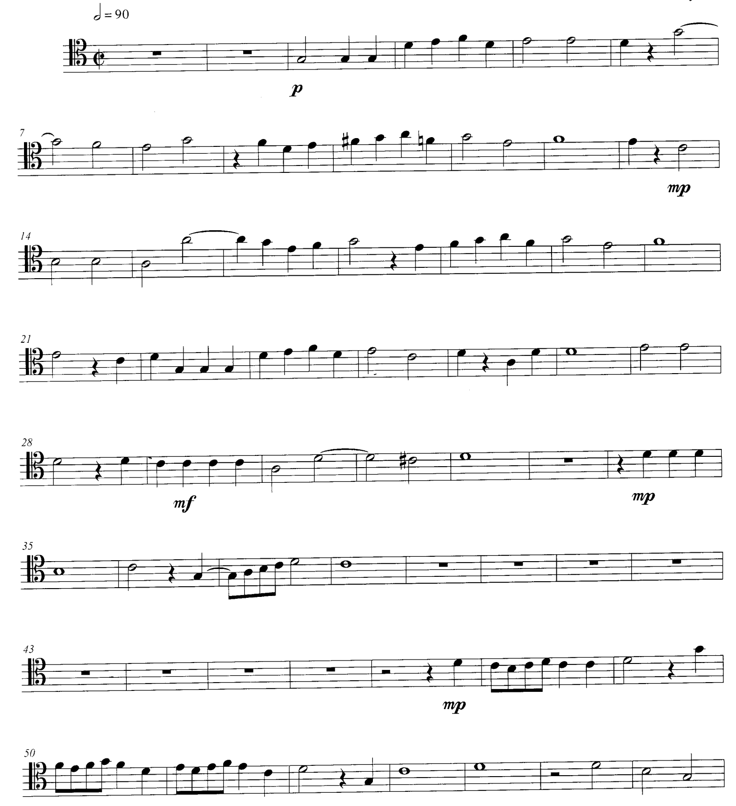
from Sacrae Symphoniae (1597)