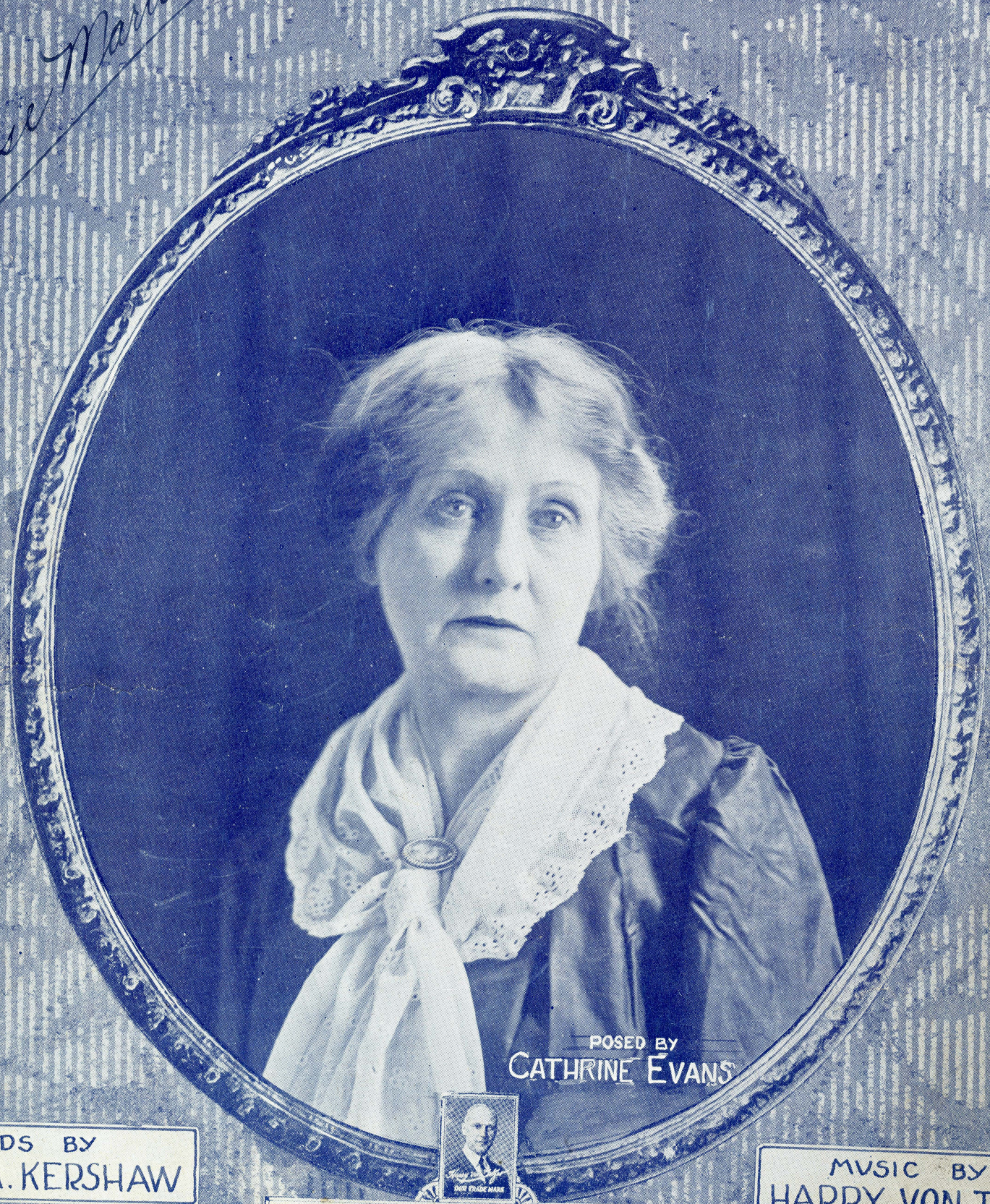
POSED BY CATHRINE EVANS