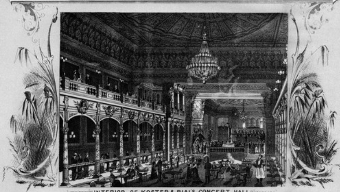
INTERIOR OF KOSTER & BIAL'S CONCERT HALL